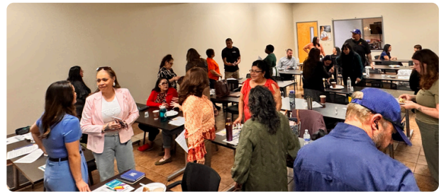
Above: Providers and others networking at the Community Connections Social event.

On March 24th, a Community Connections social event was hosted as a partnership with LC3, UNITE US of New Mexico, & Doña Ana County.