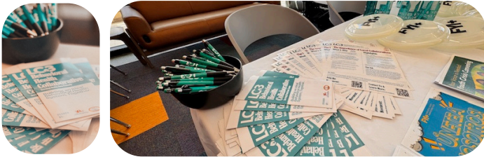
Above: LC3 at the Every Child Matters Fiesta in Anthony, NM.

On April 12th FYI+, CYFD, and many other organizations came together to recognize Child Abuse Prevention Month with a community celebration. LC3 was honored to attend and participate in this event held at the DACC Gadsden Campus in Anthony, New Mexico.