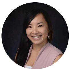
Lan Sena Center for Civic Policy

Learn more about Lan and the Center for Civic Policy Below!