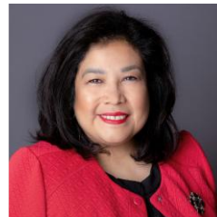
The Honorable Anna Perez Judge of the 41st District Court